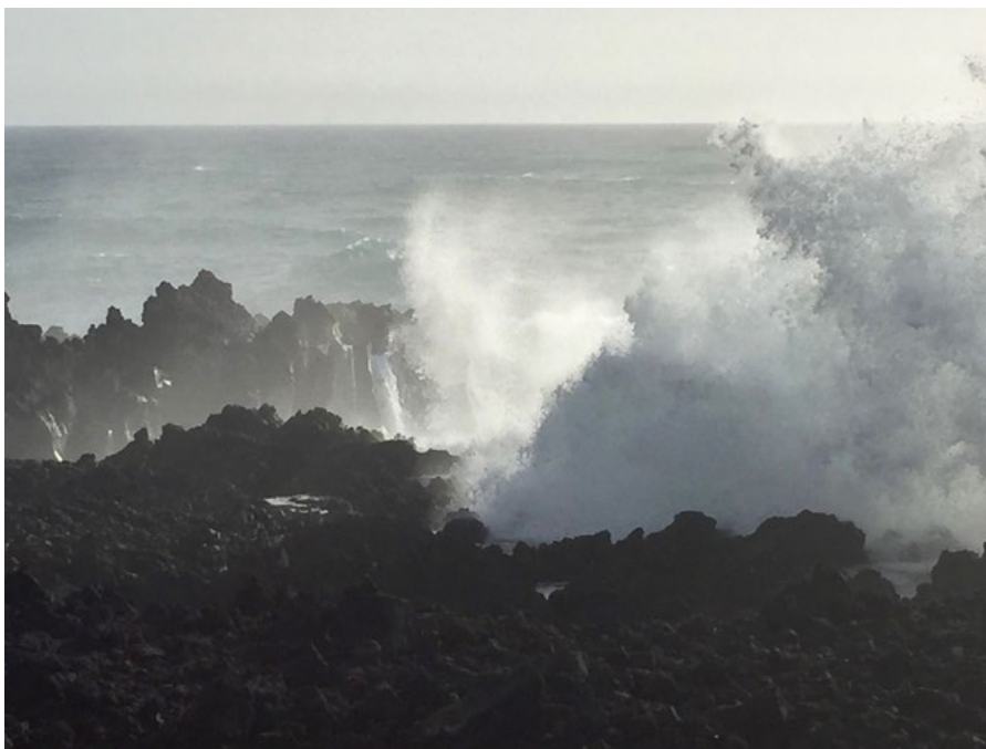
Figure 9. Waves at Ferreria, Sao Miguel, Azores.

Listen at: https://soundcloud.com/invisible-places/8-churning-waves-foam-stereo