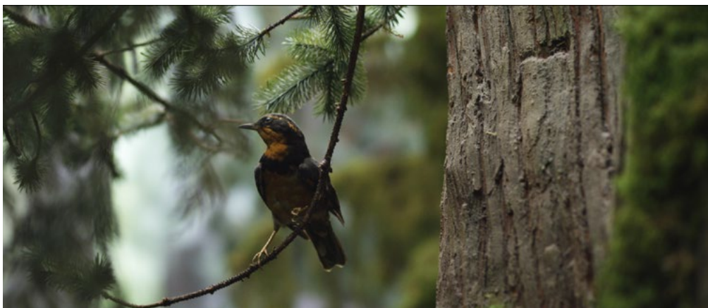
Figure 3. Forest Diorama: bird. 10

In the late 1970s the Royal British Columbia Museum in Victoria, Canada created a Natural History Gallery with exhibits of taxidermied birds and mammals, human-made trees, painted landscapes and an accompanying soundtrack of environmental sounds.