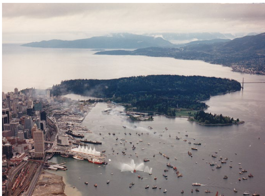
Figure 13. Harbour Symphony performance as seen from above.

As it happens, yesterday was my brother's birthday. He would have turned 82. Today is my birthday. I am 71. There is much for us to celebrate in this amazing confluence of events and realities here on the Azores. So, in conclusion I will play you a short excerpt of my composition the Harbour Symphony that was originally performed by over 100 boats at Expo 86 for the opening of the Canada Pavilion in Vancouver.