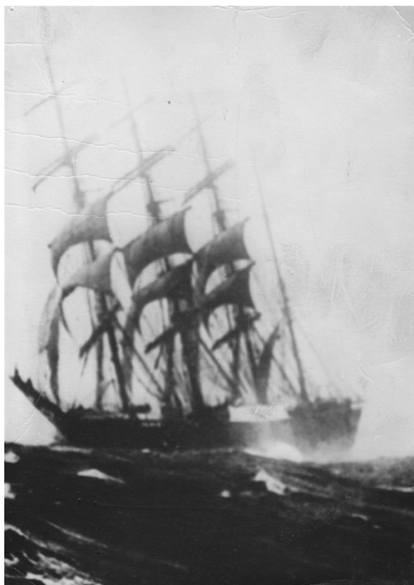
Figure 10. The Pamir in a storm.

Listen at: https://soundcloud.com/invisible-places/8-churning-waves-foam-stereo