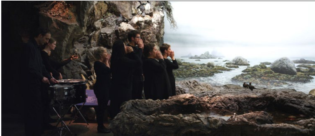
Figure 7. Shoreline Performance Group