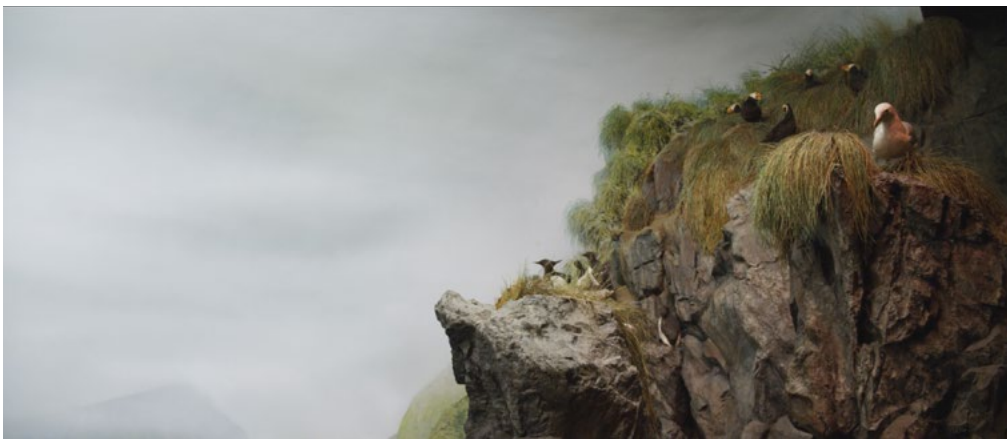
Figure 6. Shoreline Puffins.

Music for Natural History was a live performance in that space, replacing the existing soundtrack with the live sounds of sixteen vocalists, sound artists and music instrumentalists that spent weeks learning to viscerally replicate the sounds of wind, birds, mammals and ocean surf of the Pacific Northwest. The creators of this performance called the piece “part tragic love song for the wilderness, part performative sound art.” 11