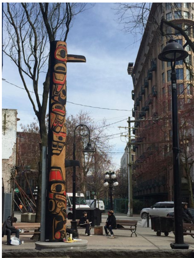
Figure 1. Survivors Totem Pole.

A few months ago a totem pole was erected on Pigeon Square in Vancouver's Downtown Eastside (DTES), an area notorious for open-air drug trade, sex work where many are homeless.