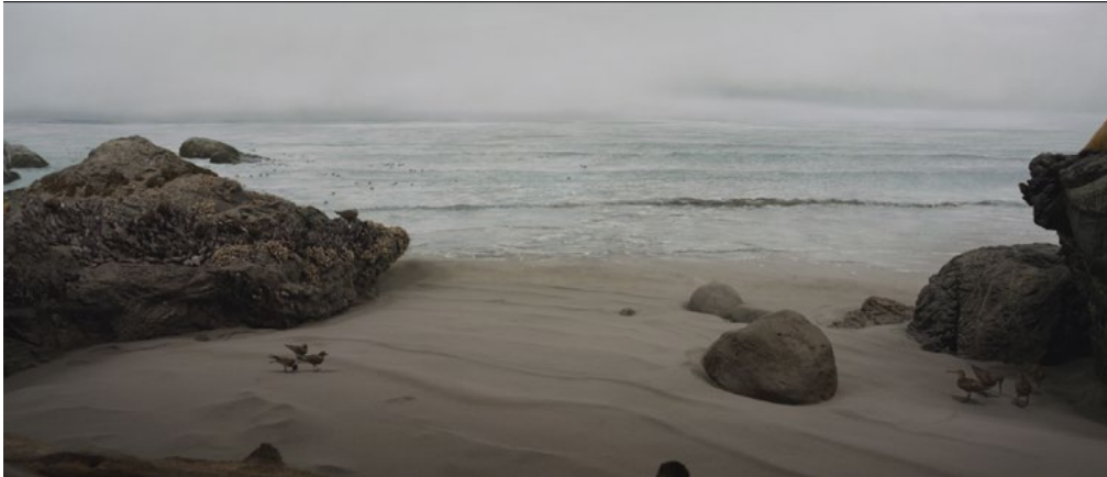
Figure 5. Shoreline-birds.