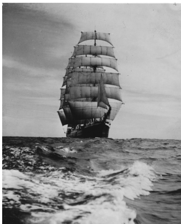
Figure 12. The Pamir in full sail.

I was 11 years old then and heard the sound, die Azoren, repeatedly on the many news-casts after the sinking of the ship and during the week of searching for survivors. Newspaper headlines – the most intense media presence at the time – although silent, sounded like aggressive screams to me. My 22 year old brother was on that ship and was among the 80 men lost at sea. Miraculously, there were six survivors.