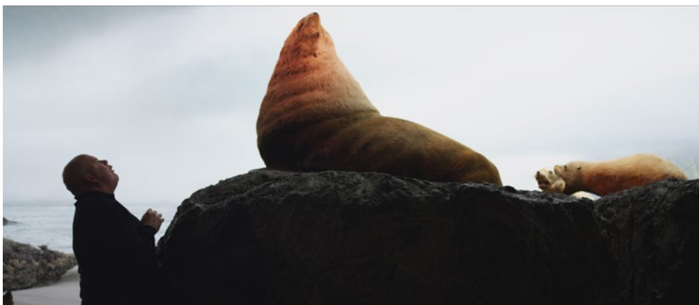
Figure 8. Shoreline Sea Lion Duo.

Listen at: https://soundcloud.com/invisible-places/7-audio330-dawn-burble-surf-sl