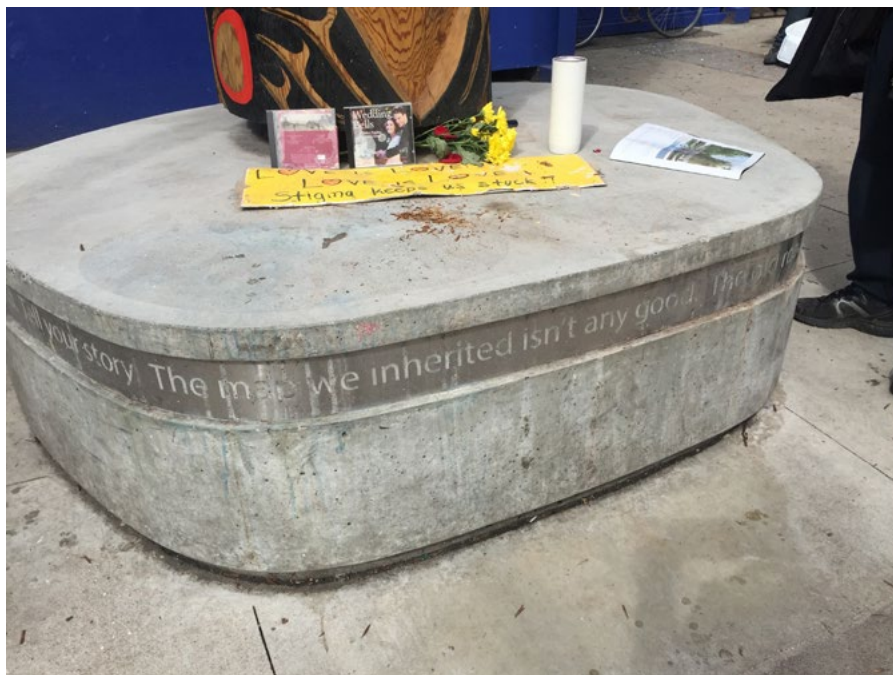
Figure 2. Base of Totem Pole.

These words speak to all of us really, in these unsettled times. And indeed as the totem pole's carver Bernie Williams says,