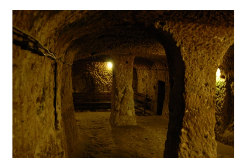
Figure 2. The church at the deepest level.

After levels of living quarters of the city, the deepest section is reached by the steep, long and narrow passages with sudden changes in direction. The lowest levels are reserved for church (Figure 2), cemetery and the end of the main ventilation shaft. The church is a relatively large area covered with a vault. The soundscape of the church is so loud that when more than one people talks, speech intelligibility blurs. In addition to that, if people want to talk each other they talk in a low voice due to the highly reflective materials around. The level of background noise determines the quality of an acoustic arena here. It can create a state of psychological tranquillity; a cooperative agreement to respect the public sound-scape and be silent.