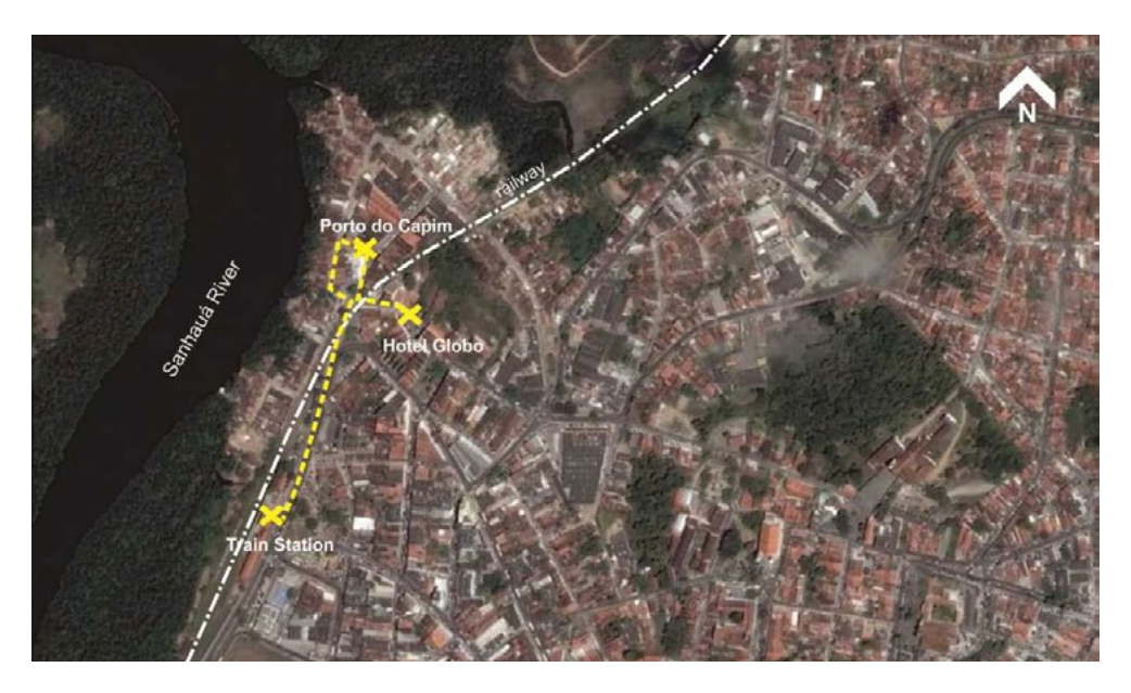
Figure 1. Passage 01.