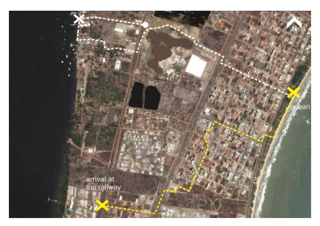
Figure 4. Passage 03 in yellow.

Already in the afternoon, we walked back towards the railway, once again crossing empty sections and pieces of the built city: organized vertical sets, always walled, barred, spread over large areas, composed of vacant lots, dirt roads and abandonment. Abandonment in two senses: as such as things we left behind, on a geographic map, in a renunciation action, or like those we do not care for in a neglectful attitude (Rocha, 2010). The forgotten city, the unlived urban time, the street, the scattered garbage, are both abandoned moments and remnants left behind. Shortly thereafter, the group sat under a tree-shade to rest for a few moments. It was then that one of the participants, a local, told stories about João Pessoa, the route, the waters that bathe the city and the encounter crossed by the flock: river water, mangrove mud and sea water. We hummed African origin religious songs to honor these three elements. Among these encounters, detachments and confrontations, the course passed, slipped in time and drew in space the marks of our intervention (Figure 4).