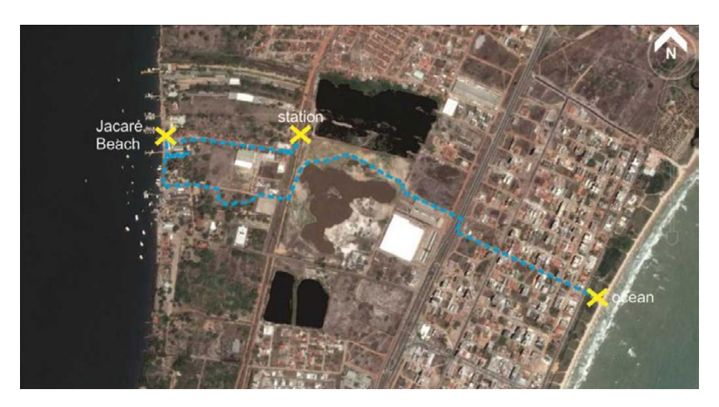
Figure 3. Passage 02.

Going around the wall, we crossed the railway when the noise of an engine rang out loud: it was a machine dredging water from the vast wetland that spread over a great void. We walked around, not in silence, but playing the harmonica again. We moved on towards a transition zone between the empty spaces and the formally built city, as a car was playing loud music. Some hummed, while we walked by unfinished apartment buildings, still on a dirt road. Ahead the street was silent, now paved with concrete; High buildings sounded lonely, from the people who lived there we heard only absence, from the children silence on an empty playground. The rising wind sound indicated a new presence: walking westward we approached the ocean (Figure 3).