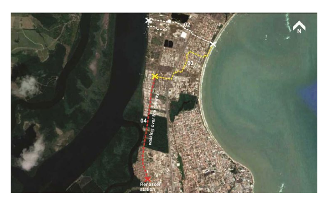
Figure 5. Passage 04 – walking over the railway, in red.

What marked me most, no doubt was the trotting of the horses that appeared near the rails we were crossing. It was a surprise to hear them in the silent place, inciting some fear at the beginning. (Excerpt from the interviews).