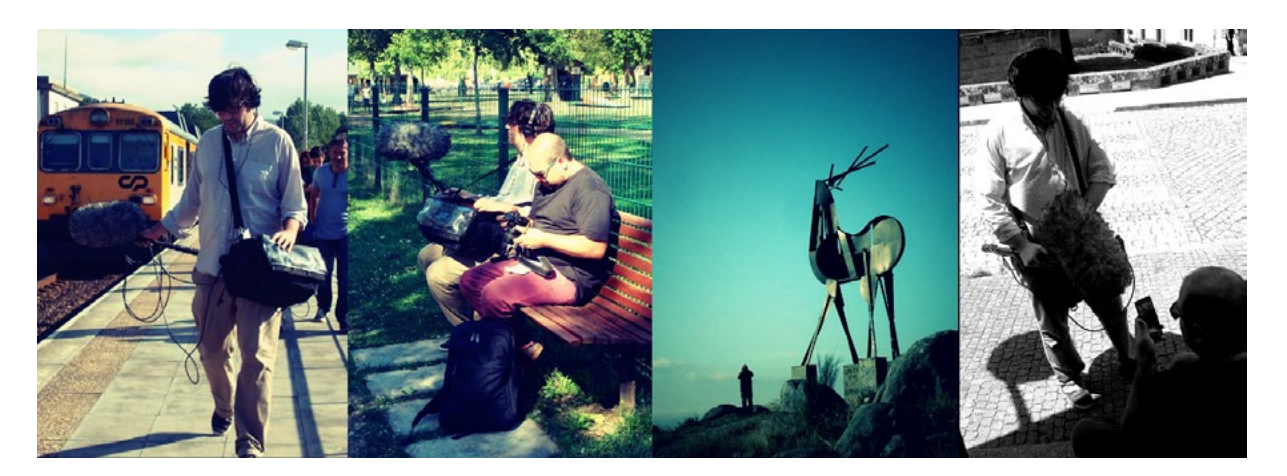
Figure 1. On site sound recording in Vila Nova de Cerveira.

Finally, in each city, a series of geo referenced field recordings of the identified sonically interesting locations within the urban space and also surrounding landmarks were made.